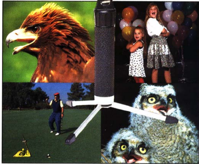
Now you can eavesdrop on an eagle, record your child's starring part in the school play and hear the winning putt rattle to the bottom of the cup.

To order your Audio Telescope risk free with your credit card, call toll free or send your check for just $69 90 ($4 P&H). Order